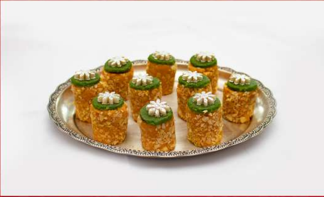
Badam Orange Gift