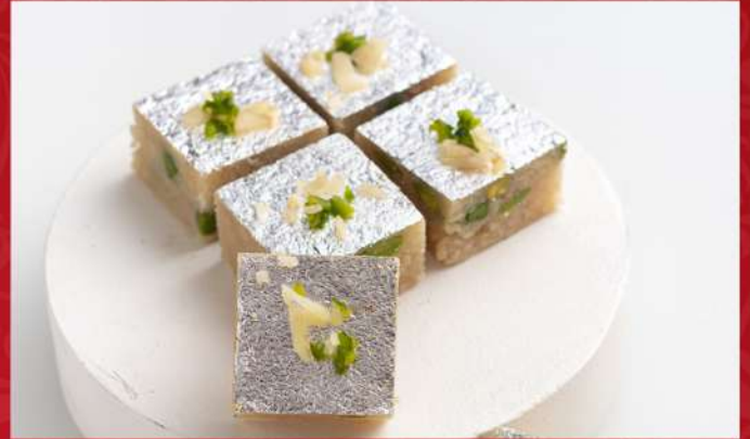
Badam Danedar Chakki