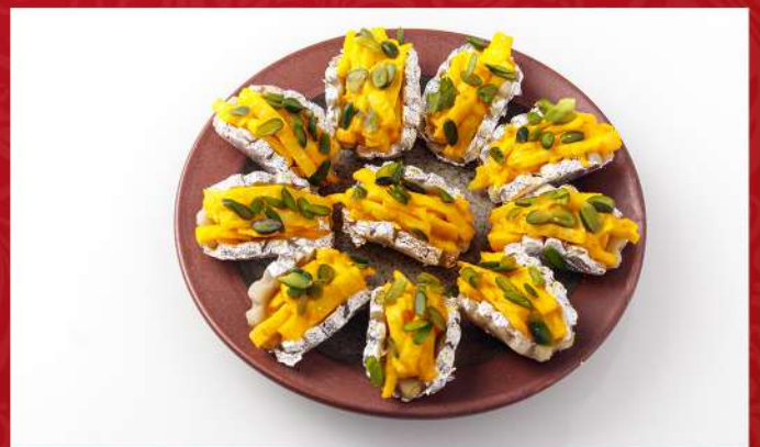
Badam Malai Tacos