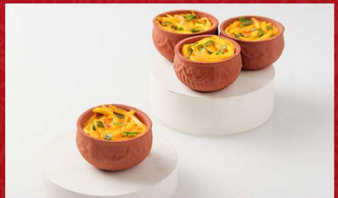
Matki Mango Muzzafar