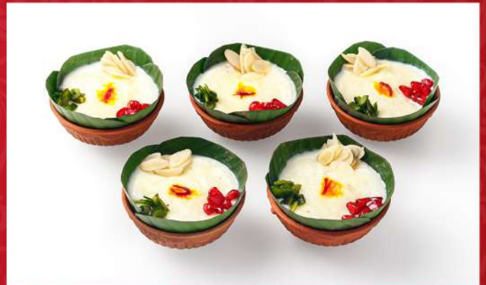
Matki Malai Rock & Roll