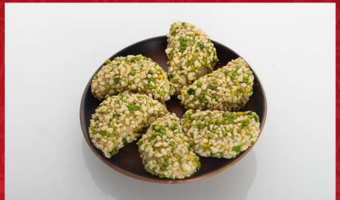
Kaju Pista Gujiya