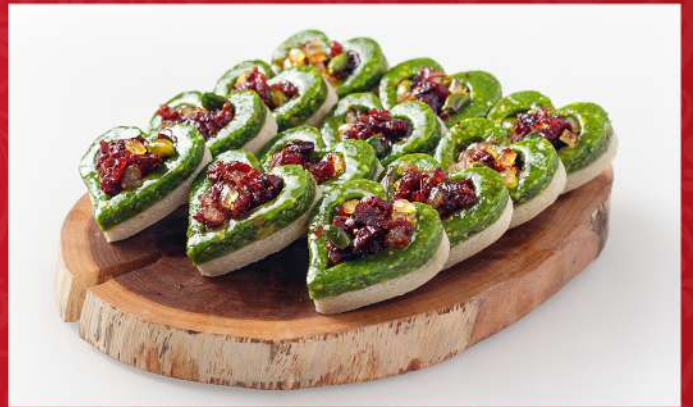
Badam Pista Heart