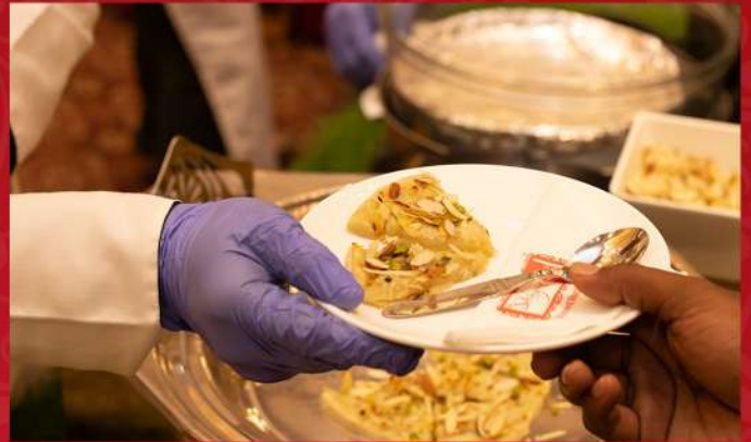
Bake Badam Malai Pizza