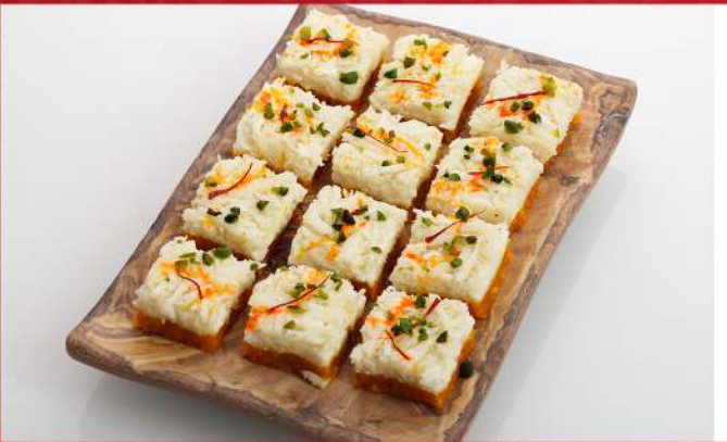
Badam Danedar Malai Burfi