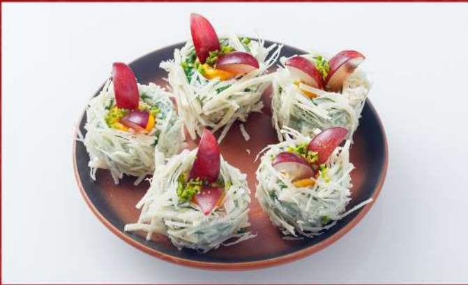
Pista Kadam Bari