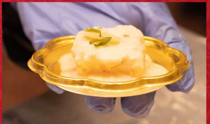
Chenha Double Ka Meetha