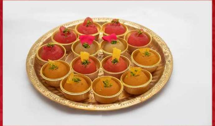
Assorted Petha Phal