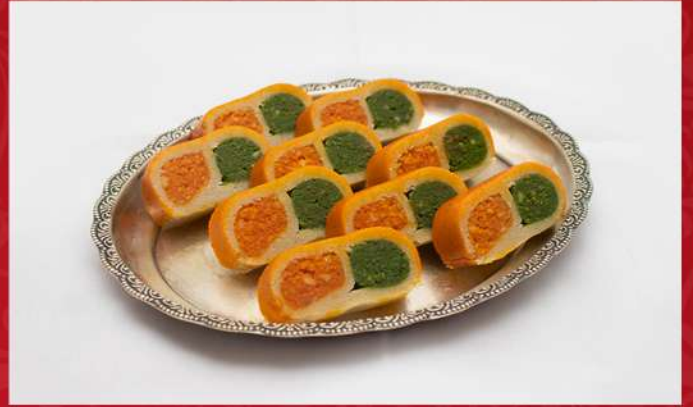
Badam Pista Casata