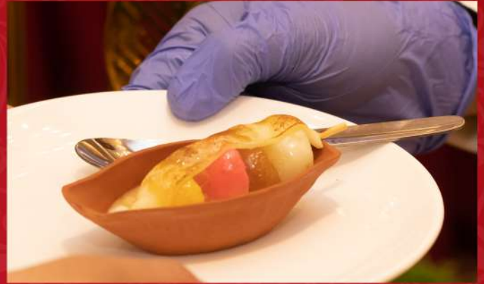
Sweet Cheese Kebab