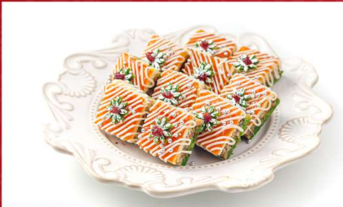
Mango Pista Delight