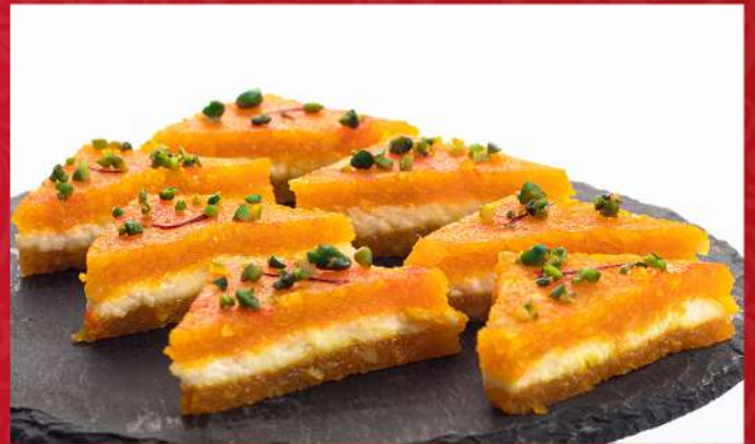
Badam Danedar Malai Sandwich