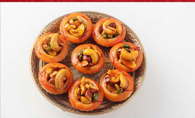
Badam Honey Katori