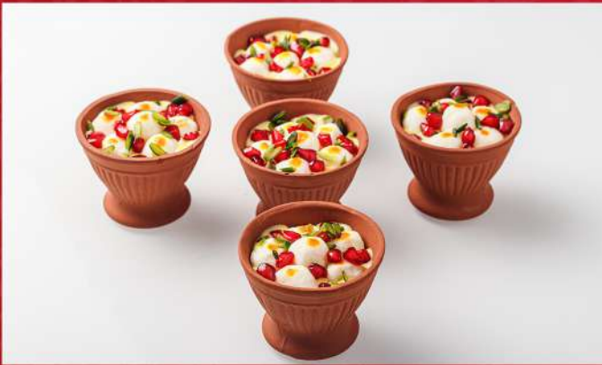
World Cup Chenha Payas