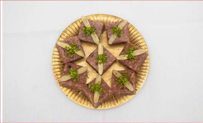
Badam Blueberry Burfi