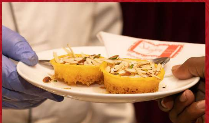
Live Mini Ghevar