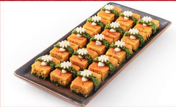
Badam Pista Gift Pack