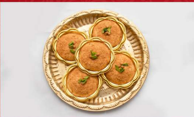
Chenha Butterscotch Tikiya