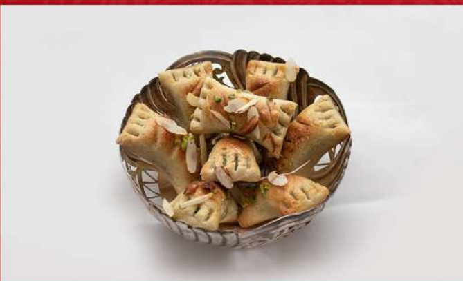
Bake Badam Puff